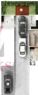
Lower Ground Floor Plan