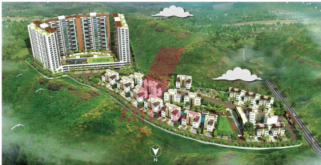
Satellite view of Gera's Isle Royale