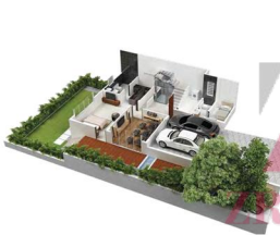
Lower Ground Floor Sectional View