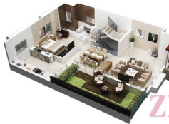
Ground Floor Sectional View