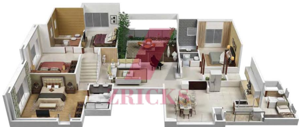
Odd Floor Unit Sectional View