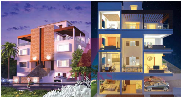
Maple & Wisteria Villas