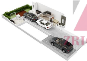
Lower Ground Floor Sectional View